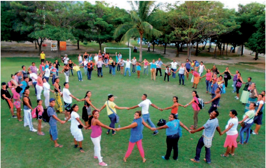
Norwegian Refugee Council Colombia Peace Culture High School Program's meeting with graduate students in Santa Marta, Colombia.