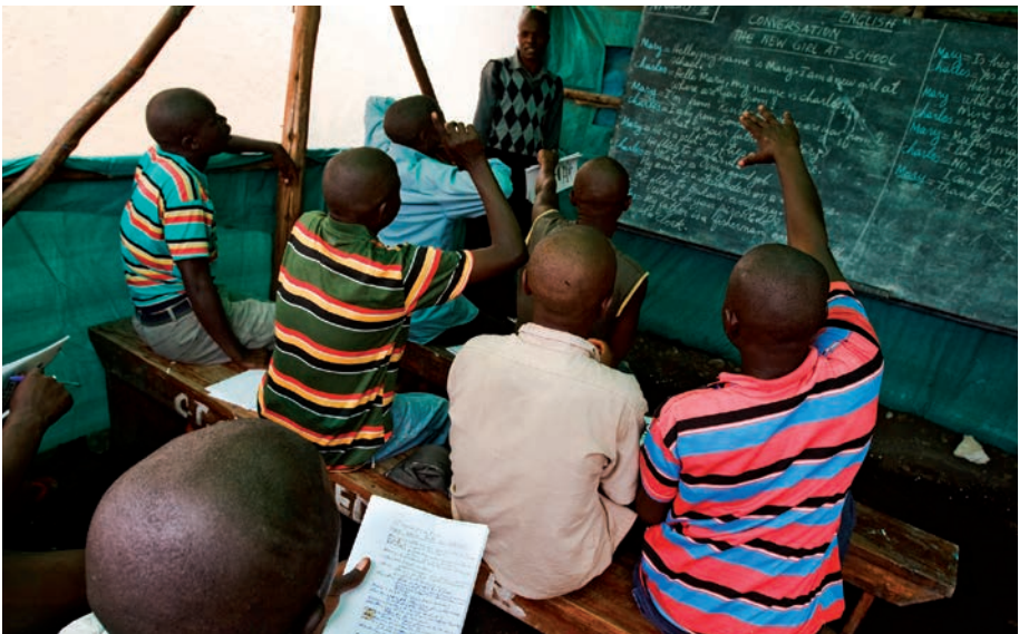
Former child soldiers attend an English class, at a transit and orientation centre run by the national NGO CAJED (Concert d'Action pour Jeunes et Enfants Défavorisés), in the eastern city of Goma, capital of North Kivu Province, Democratic Republic of the Congo.

Do programmes that include activities to improve education facilities and services take into consideration the historical and present conflict context?