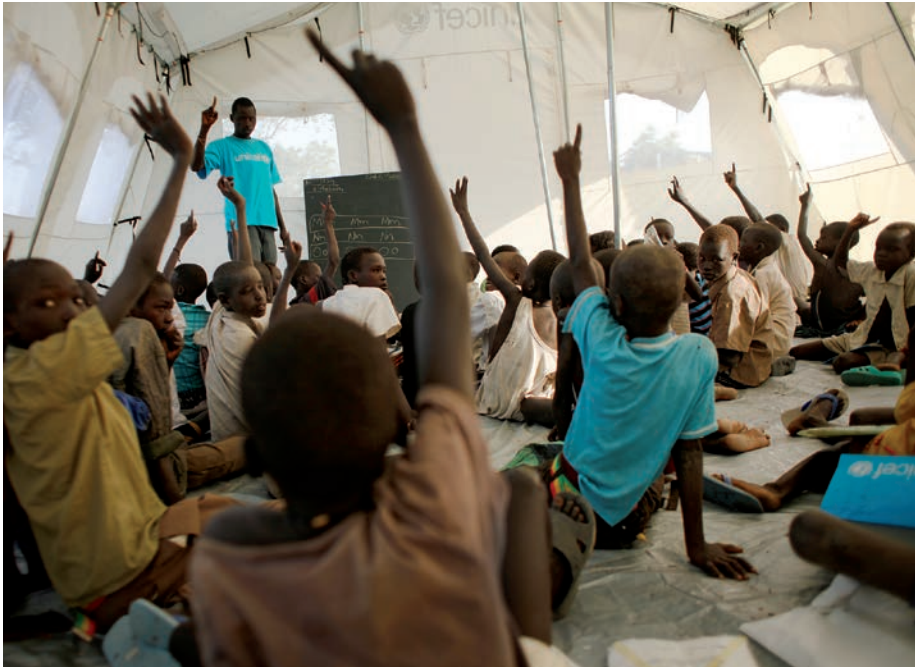
Boys who have been displaced by inter-ethnic violence attend an English class. The class is being held at a UNICEF-supported child-friendly space that is housed in a tent, in Pibor Town, Pibor County, Jonglei State in South Sudan.