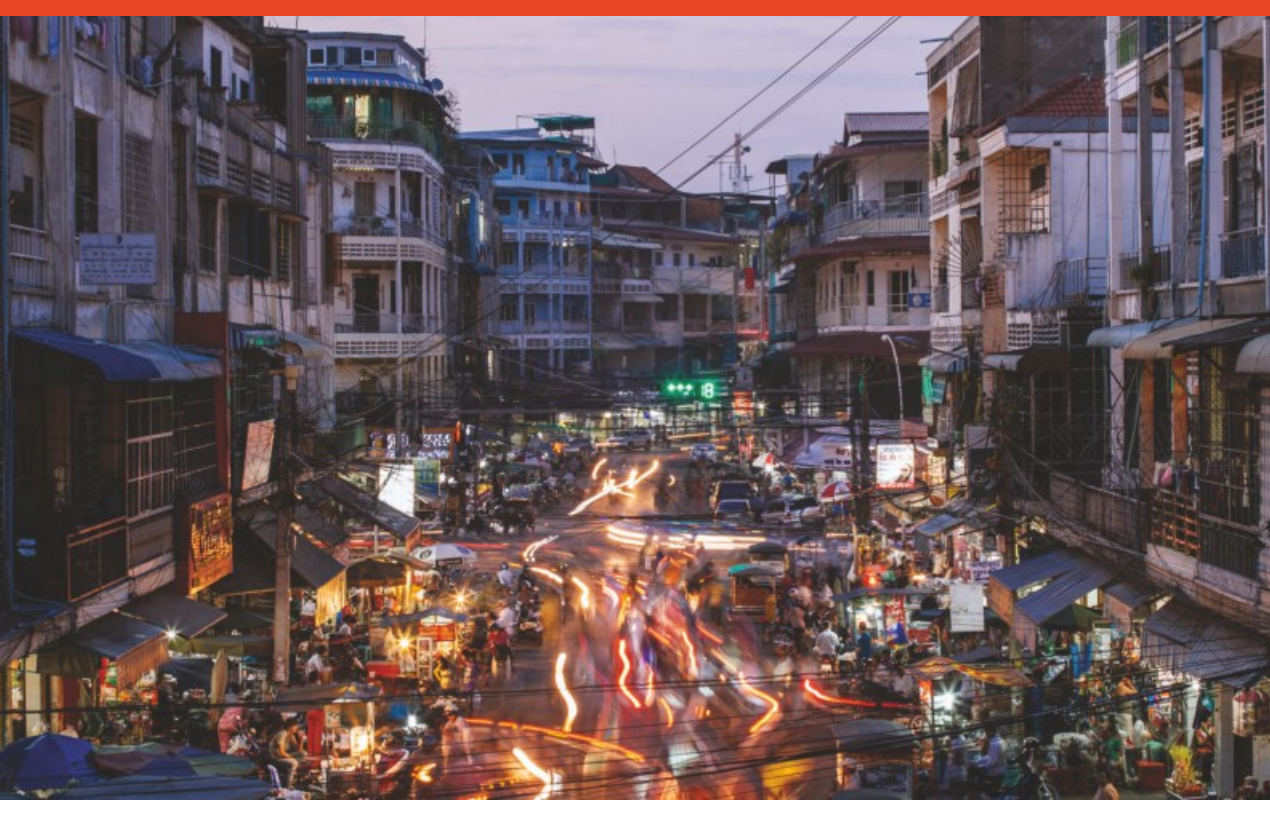
Photo 1: Buzzing Phnom Penh is urbanising at a fast rate.