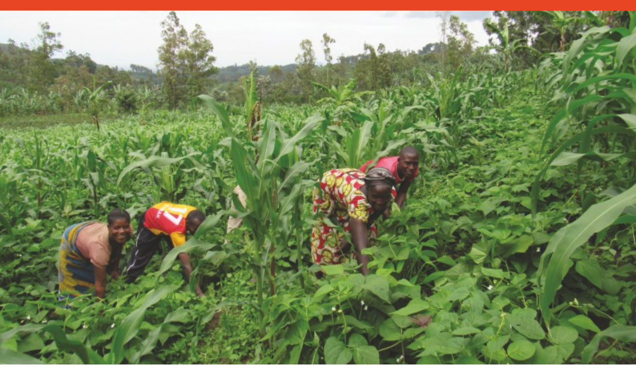
Photo 1: On the model training fields, farmers learn how to grow more nutritious crops effectively.