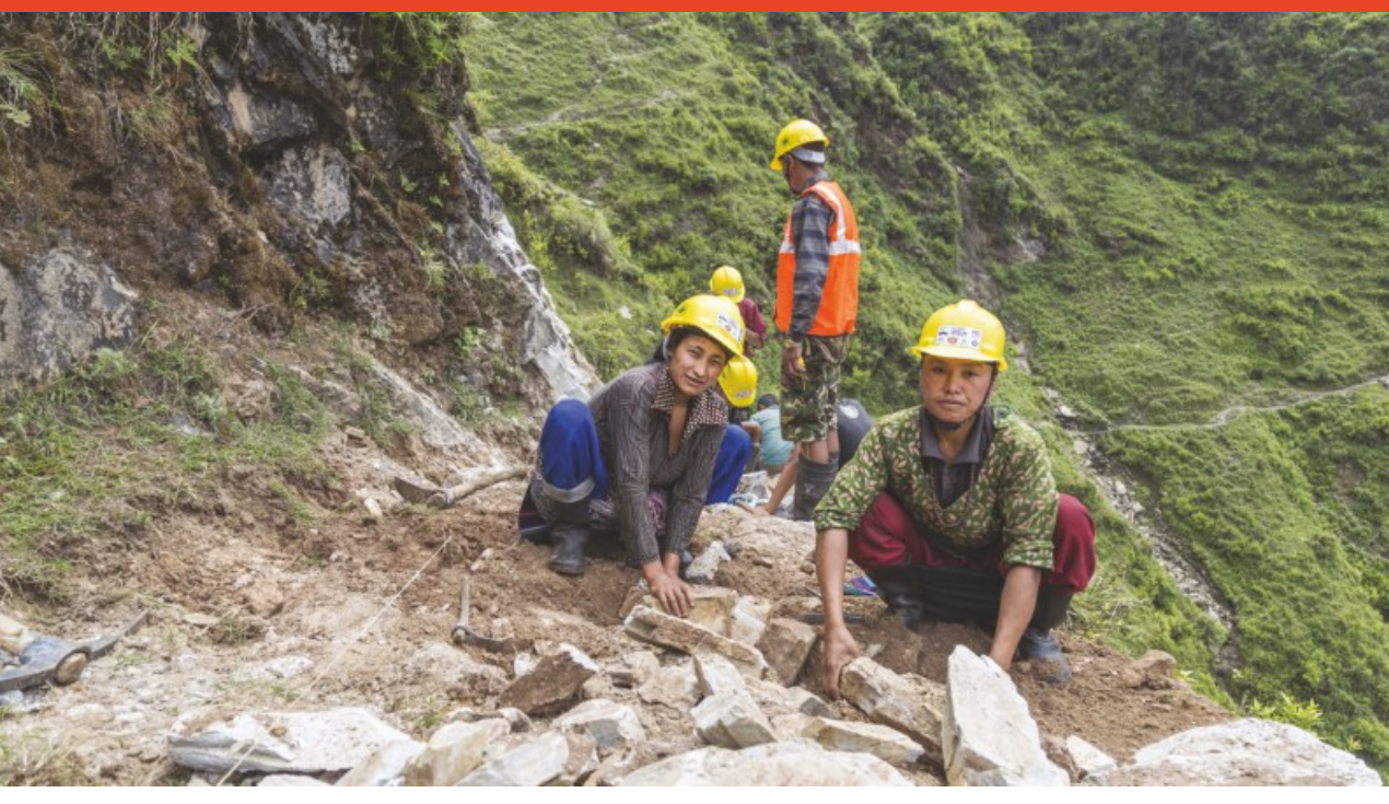
Photo 1: Male and female workers breaking rocks for the trails in Rasuwa, Nepal.