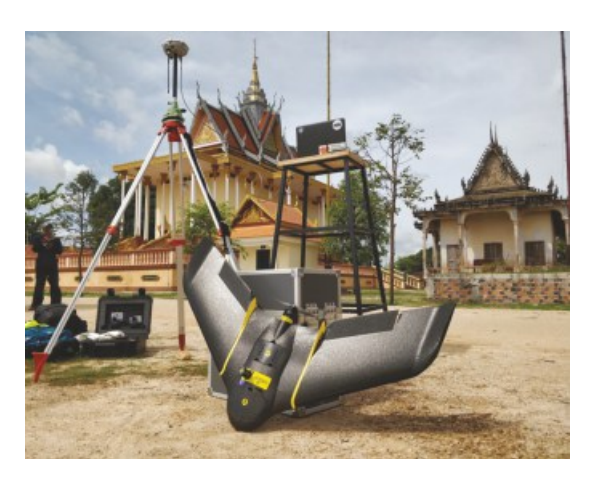
Photo 4: PIN preparing for flight in Kampong Chhnang.

Since 2016, PIN has been using unmanned aerial vehicles (UAVs), commonly known as drones, to collect elevation imagery for the production of maps required for disaster risk reduction (DRR) activities. The development of Emergency Preparedness and Response plans (EPRPs) is an important element of DRR support that PIN provides to local authorities and for which good satellite or aerial imagery is an essential requirement. The ability to study elevation levels is vital as it enables us to predict and model flooding scenarios, thus allowing us to identify the most-vulnerable areas and inform nearby residents of the risk. Moreover, with this data we can identify evacuation options, at-risk populations, property and infrastructure, as well as design appropriate preparedness, mitigation and adaptation measures. If the imagery is of high quality, it is even possible to estimate the vulnerability of physical structures.