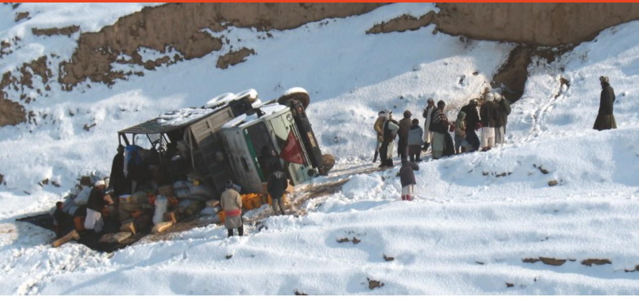
Photo 2: In early 2017, heavy snowfall and freezing weather killed 27 children under the age of five across remote districts of northern Afghanistan.