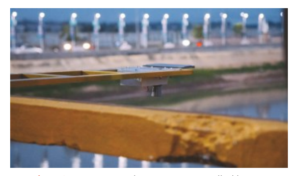
Photo 3: An automated water gauge, installed by PIN in Kampong Thom, measures river height with sensor technology.

The ability of automated water gauges to continuously record water levels and transmit the data