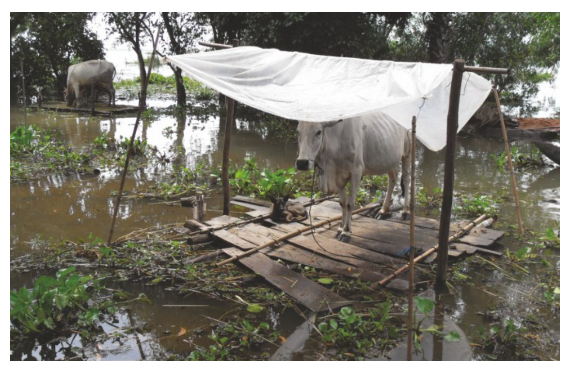
Photo 2: Flooding threatens livelihoods in Cambodia.

up to 8 months of the year, triggering waterborne disease outbreaks. In the future, climate change is expected to exacerbate flooding.<sup>17</sup>