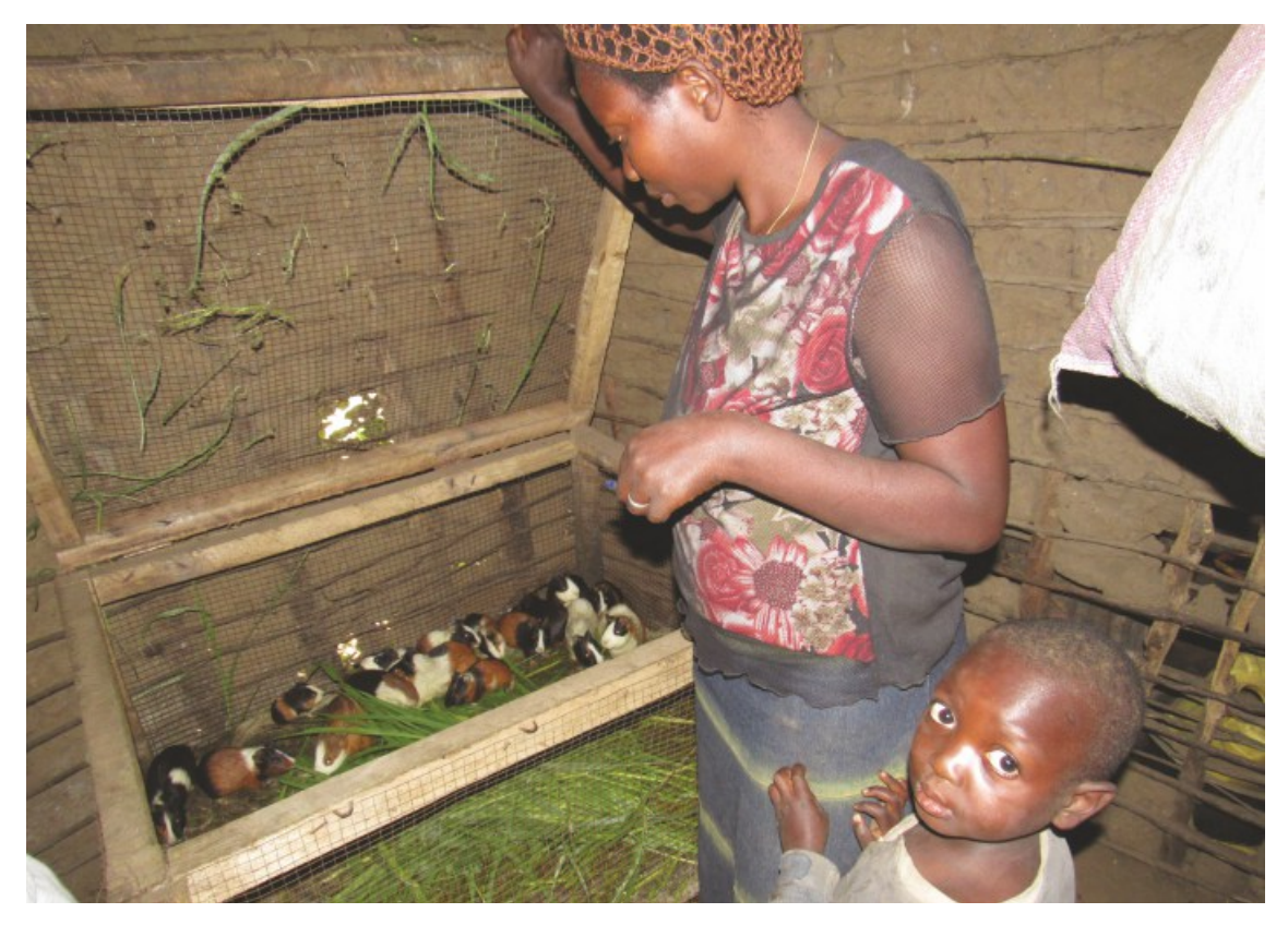
Photo 2: Guinea pigs are a great alternative source of livelihood for many families.

prevention. PIN's multi-sectoral interventions tackle the causes of malnutrition in a holistic way through improved health, food security, hygiene and education. We call this approach IPIN."