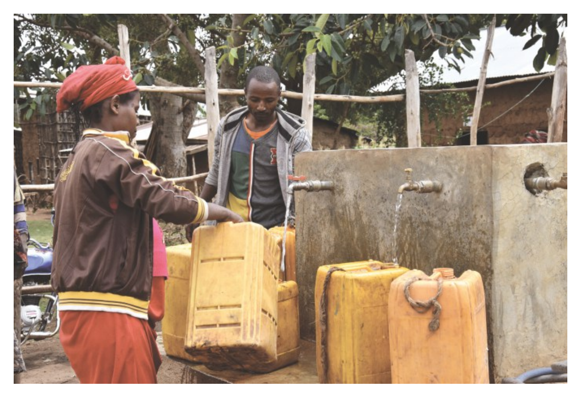
Photo 2: Using jerry cans people can carry and store water more safely.

rity and resilience of a household. Women and girls are most often the primary users, providers and managers of water in their households and are also the guardians of household hygiene. If a water system falls into disrepair, women and children are the ones forced to travel long distances for many hours to meet their families' water needs. The assessment also revealed a critical situation in local schools, where over 70% had no access to safe drinking water and 80% were without a toilet.