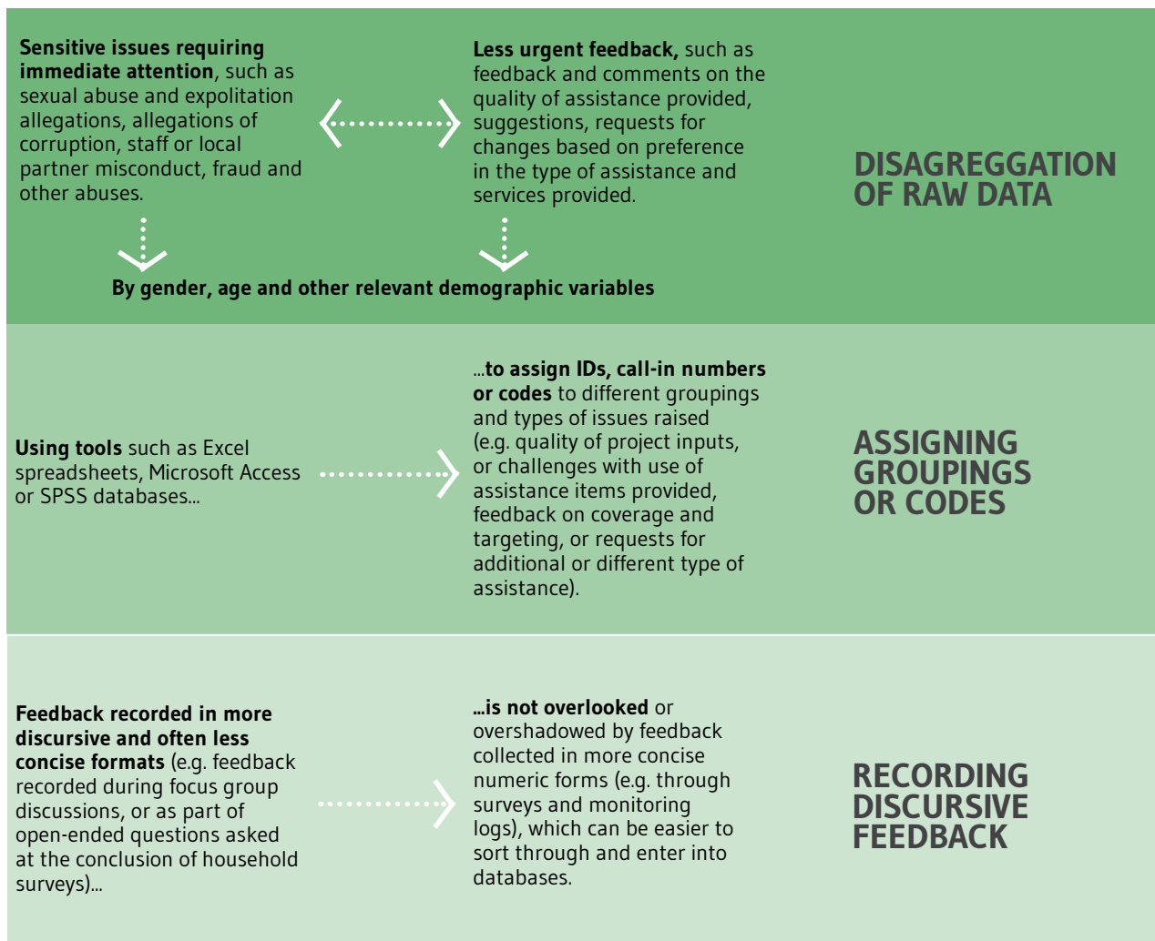
Table 4: Potential components to build into feedback collection and sorting process

Consider the following issues when sorting feedback.