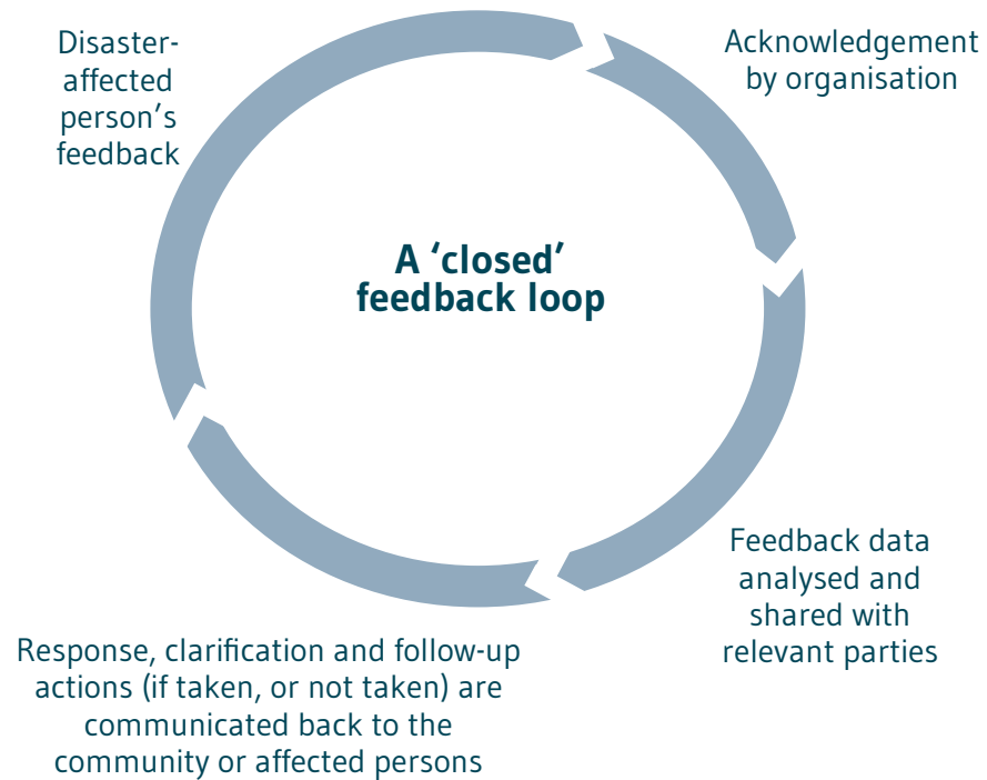
Figure 1: A 'closed' feedback loop